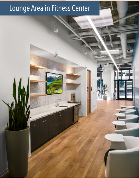
Lounge Area in Fitness Center