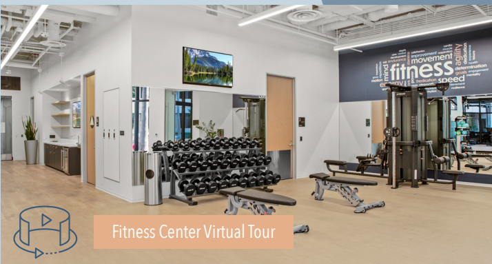
Fitness Center Virtual Tour