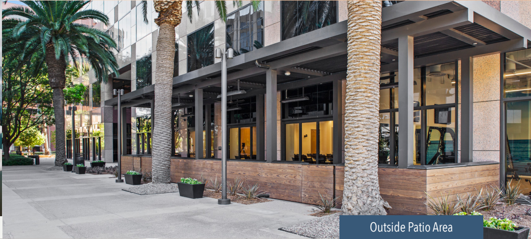
Outside Patio Area